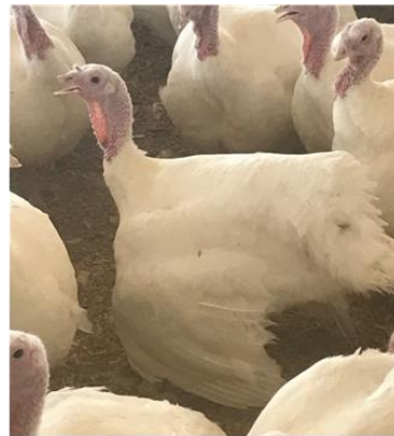
Panting and Wings Drooping