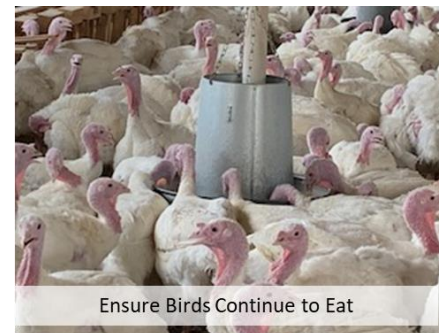
Ensure Birds Continue to Eat

Closely monitor feed consumption of the flock during hot weather; feed intake can reduce by as much as 30% during hot conditions. Adjust the nutrient specification levels to ensure intake of key nutrients is maintained. The critical nutrients are digestible amino acids, energy, calcium, sodium and phosphorus.