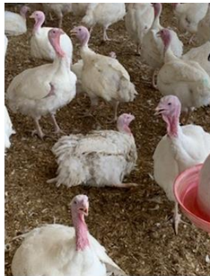
Burrowing in the Litter