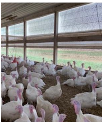
Seeking Cooler Areas